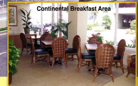
Continental Breakfast Area

1804 South Ocean Blvd., Myrtle Beach, SC 29577 ■ Email: info@myrtlebeachbestwestern.com ■ (843) 448-1461